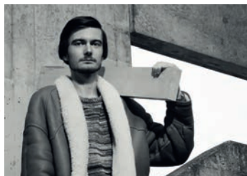
Joint 3 rd PRIZE ex æquo · LUC by MATHIEU LANG (Switzerland)